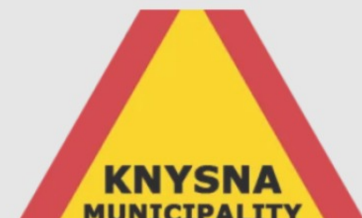
Did Ignored Safety Rules Kill Employee & Injure Others?