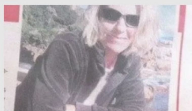
The Mayor, The Spokesman, The Editor & The ISDF