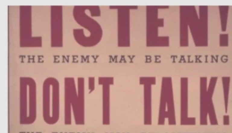
The ANC Responds to Eleonor Bouw Queries