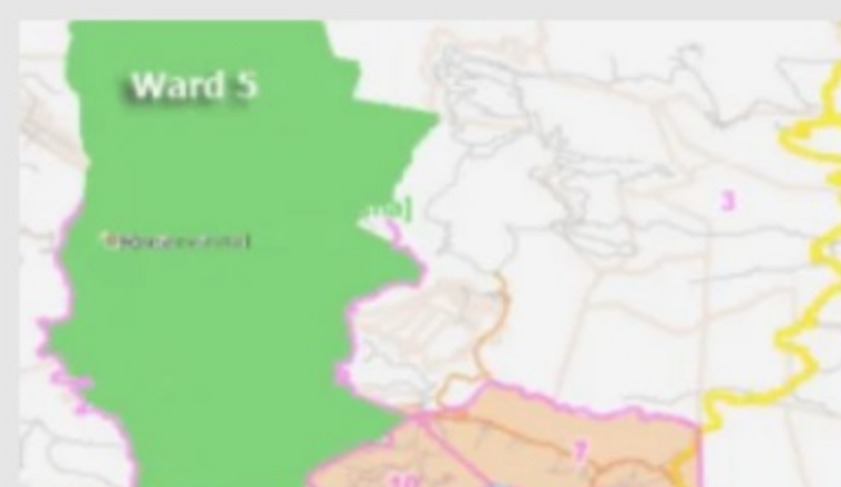
The Battle for Rheenedal is the War for Knysna