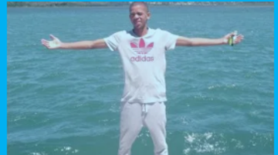
Quay 4 & SANParks Rocked Again November 22, 2015 In "Love Knysna Projects"