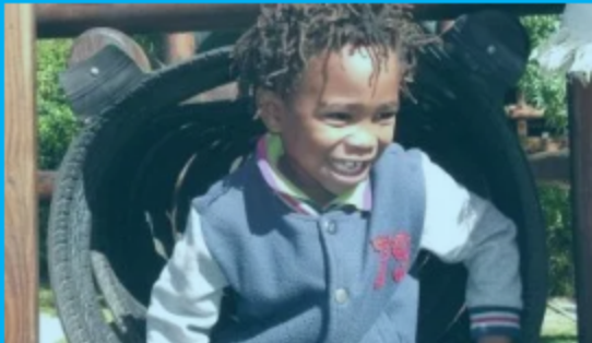
Help Us Help Knysna's Children November 7, 2015 In "Love Knysna Projects"